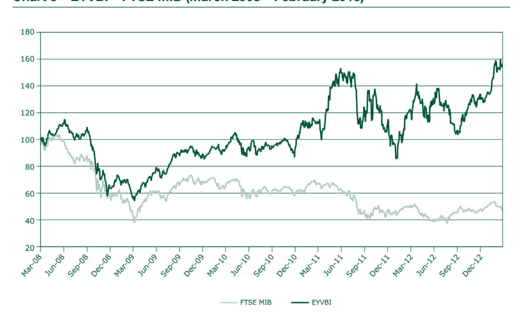
Chart 3 - EYVBI - FTSE MIB (March 2008 - February 2013)