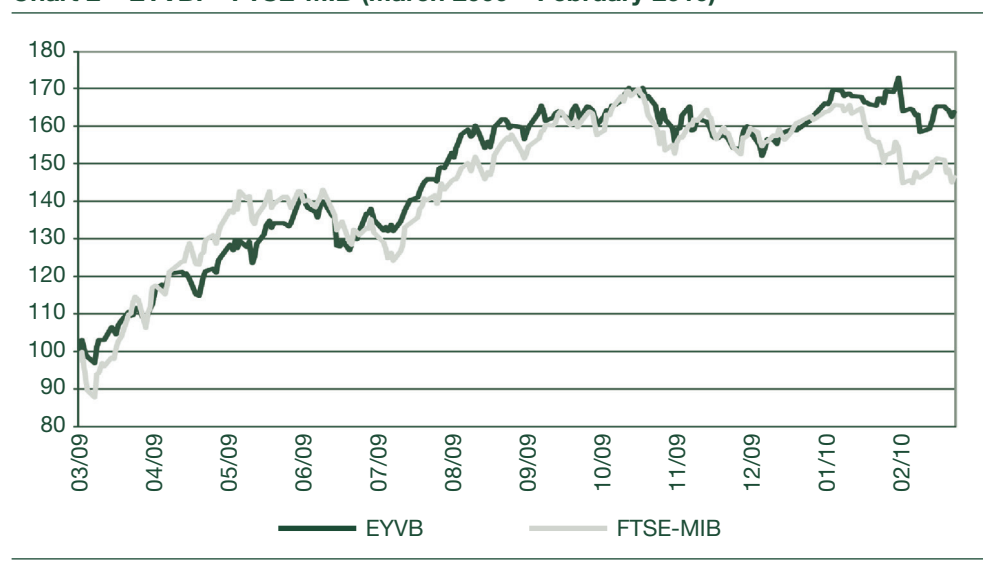
Chart 2 - EYVBI - FTSE-MIB (March 2009 - February 2010)

The following chart summarises the performance of the EYVBI from March 1, 2009 through February 28, 2010.